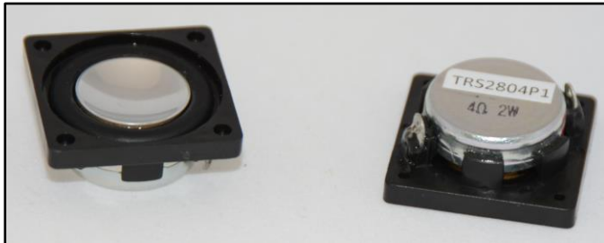
Our TRS-2804 series is a one-inch square, high watt output speaker with a wide frequency range and a mylar membrane for moisture protection.

Introducing our newest product, the TRIP-2612P . This is a one-of-a-kind part with a low 400 Hz frequency piezo which compares to all electromechanical buzzers. This part is still in the development process so keep an ear open for this product because we will be releasing more information about it later this year!